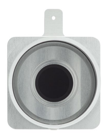
Figure 5 DR01 first class pyrheliometer front view