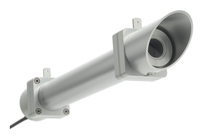
Figure 2 DR01 pyrheliometer showing its heated window