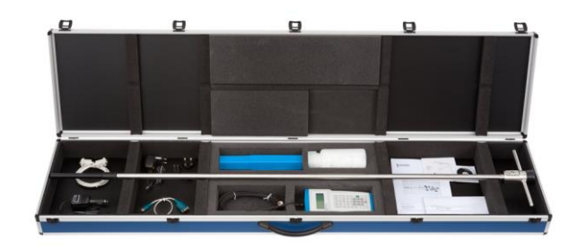
Figure 5 The complete FTN02 system: FTN02 includes one spare sensor TP09, adapters for charging the system in the office, WSA02, and in an automobile, CA02. Also included are communication software and a jar for glycerol. Glycerol must be purchased locally.