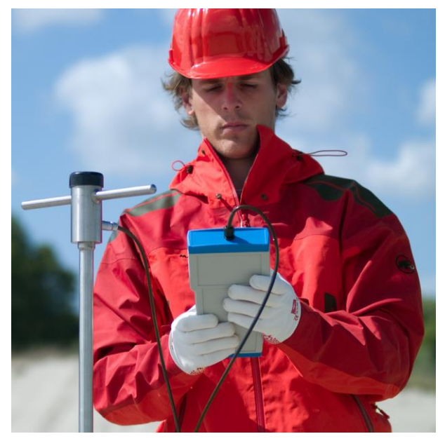
Figure 2 FTN02 being used in an on-site (field) survey

FTN02 is a thermal needle measuring system for on-site measurements of thermal conductivity (or the inverse value, resistivity) at depths from the surface down to a depth of 1.5 metre. Due to its robustness and length, FTN02 is the best solution for route-surveying of high-voltage electric power cables and heated pipelines (typical depth of burial of 1.5 m). The measurement method is based on the use of a "thermal needle". This method employs a heating wire and a temperature sensor in a needle. The FTN02 system consists of the thermal needle, model TP09, mounted on a long lance, LN02, and a control and readout unit CRU02. FTN02 is easy to use. After making a small-diameter access hole, the thermal needle TP09 is brought down to just above the point that must be investigated and then pushed into the local undisturbed soil below. The user performs control and readout of the measurement from the handheld CRU02.