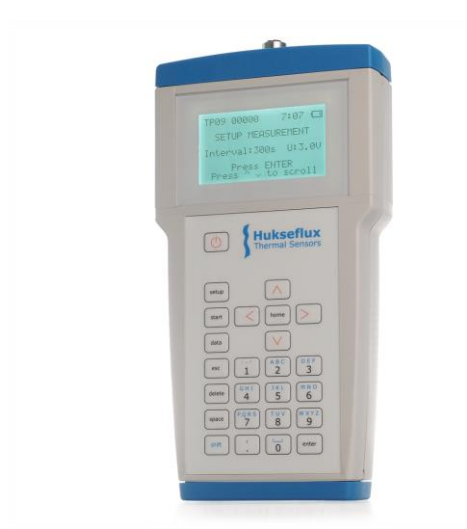
Figure 4 FTN02: CRU02 control and read out unit