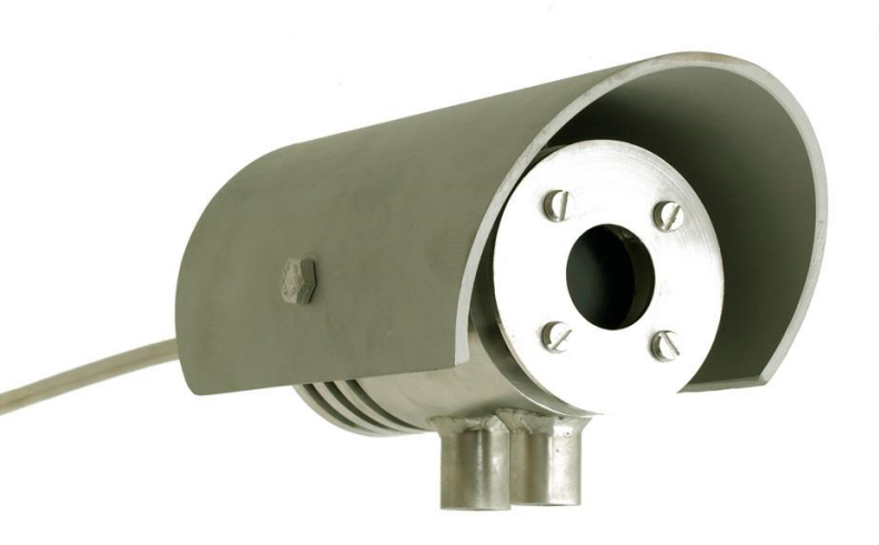
Figure 1 HF02 flare radiation monitor / heat flux sensor

HF02 is a sensor that measures radiant heat flux or thermal radiation in the outdoor environment. A common application is monitoring the radiation emitted by flares. HF02 is certified for use in potentially explosive atmospheres, and is rated for radiation levels up to 15 \times 10^3 W/m². We recommend use of HF02 in a decision-supporting role only, and not to use measurements of HF02 as the main or sole source of information for judging safety.