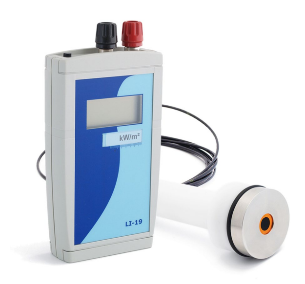
Figure 1 HF03-LI19 portable heat flux sensor with read-out unit / datalogger

HF03 is a heat flux sensor that is applied in mobile measurements. It is combined with L119, a high accuracy handheld read-out unit / datalogger. The combination HF03- L119 is typically used to study heat flux levels of flares and fires, and to verify the performance of permanently installed flare radiation monitors and flare heat flux sensors.