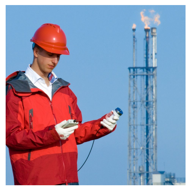
Figure 2 We offer an extensive range of products for fire testing and studies of flares. The picture shows HF03-L119 portable heat flux sensor with read-out unit.