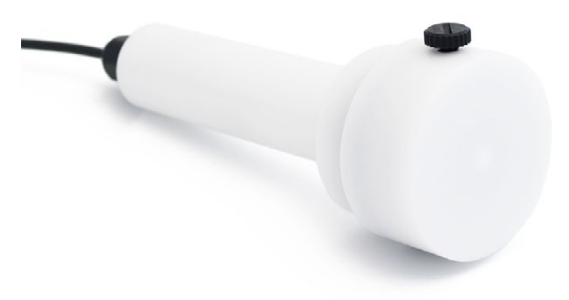
Figure 4 HF03 with its protection cap