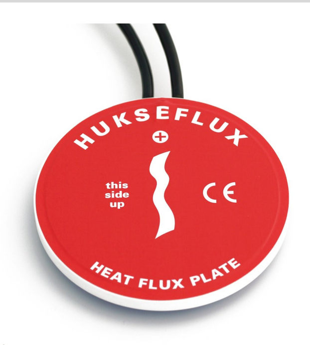
Figure 1 HFP01SC self-calibrating heat flux sensor. The opposite side has a blue coloured cover.

HFP01SC self-calibrating heat flux sensor<sup>TM</sup> is a heat flux sensor for use in the soil. It offers the best available accuracy and quality assurance of the measurement. The on-line self-test verifies the stable performance and good thermal contact of sensors that are buried and cannot be visually inspected and taken to the laboratory for recalibration. The self-test also includes self-calibration which compensates for measurement errors caused by the thermal conductivity of the surrounding soil (which varies with soil moisture content), for sensor non-stability and for temperature dependence.