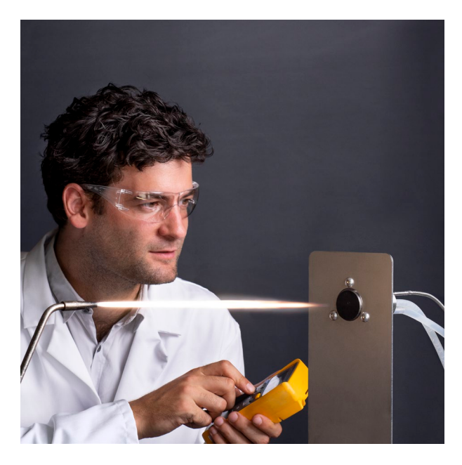
Figure 2 HFS01 is the sensor of choice for studies of concentrated sun and high-intensity flames

Figure 1 HFS01 high heat flux sensor, water cooled