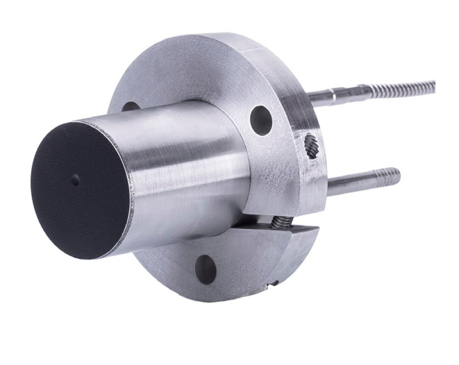
Figure 1 HFS01 high heat flux sensor, water cooled

HFS01 is a water-cooled sensor that measures high-level radiative and convective heat fluxes. It is designed for studies of concentrated solar irradiance (800 x concentrated direct solar radiation) and high-intensity flames (gas burners, coal fires, etc.). HFS01 has a very robust all-metal / ceramics instrument body and sensor, and is equipped with a high-temperature cable to survive the extreme conditions of a typical experiment.