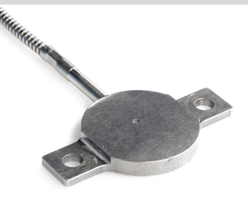
Figure 1 IHF01 industrial heat flux sensor

IHF01 industrial heat flux sensor measures heat flux and temperature, typically in industrial high-temperature environments. IHF01 is waterproof, withstands high pressures and is extremely robust. With signal wires electrically insulated from the sensor body, it complies with industrial safety standards, such as CE and ATEX for explosive areas. IHF01 is particularly suitable for trend-monitoring and comparative testing. The same technology can be used to manufacture heat flux sensors for different applications.