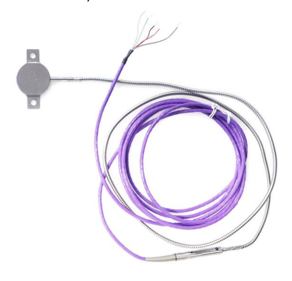
Figure 5 IHF01 as delivered in its standard configuration

IHF01 is most suitable for relative measurements, i.e. monitoring of trends relative to a certain reference point in time or comparing heat flux at one location to the heat flux at another location. If the user wants to perform accurate absolute measurements with IHF01, as opposed to relative measurements, the user must make his own uncertainty evaluation and correction for systematic errors.