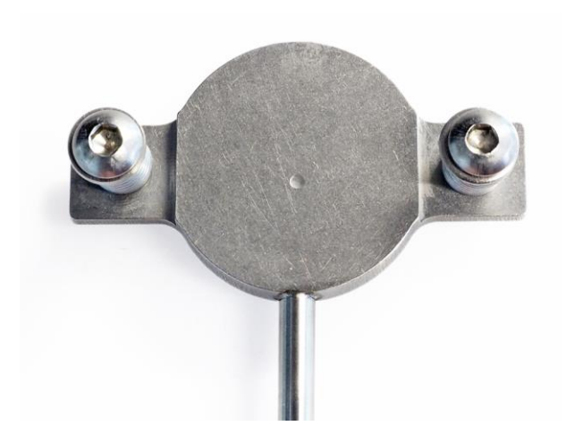
Figure 6 IHF01 with spring-loaded bolts for mounting on a well-prepared flat surface using tack-welded threads

IHF01 calibration is traceable to international standards. The factory calibration method follows the recommended practice of ASTM C1130-17.