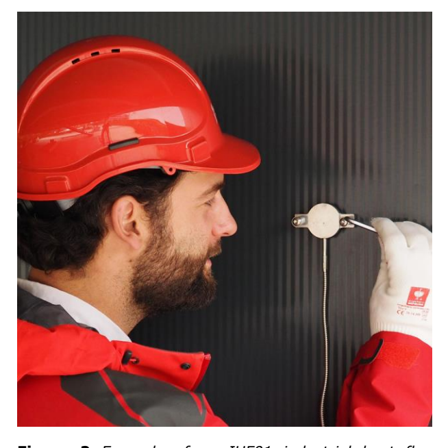
Figure 2 Example of an IHF01 industrial heat flux sensor mounted on a wall using tack-welded threads and spring-loaded bolts