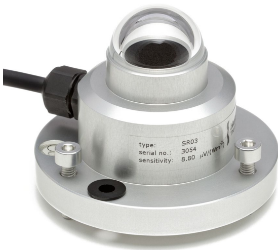
Figure 1 SR03 fast response second class pyranometer

SR03 is the fastest ISO 9060 second class compliant pyranometer available. Due to major advances in thermopile sensing technology, SR03 achieves a 95 % response time in less than 3 seconds. SR03 is optimally suited for PV system performance monitoring, where long-term stability and synchronous response time between the PV module / array and pyranometer are required.