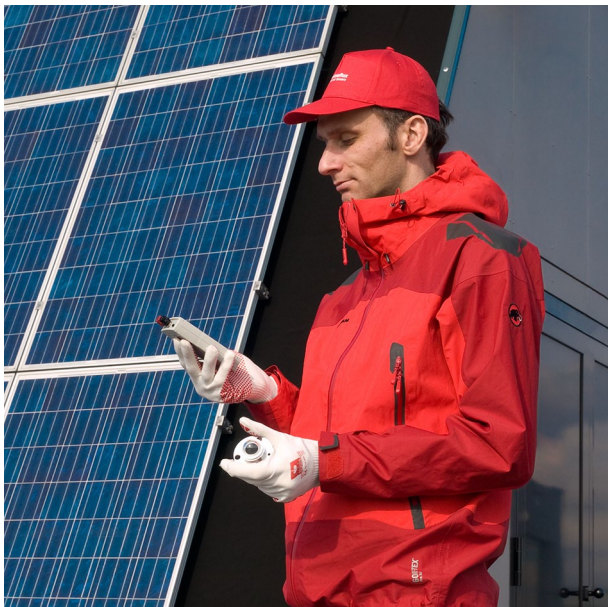
Figure 2 pyranometer in use with LI19 read-out unit