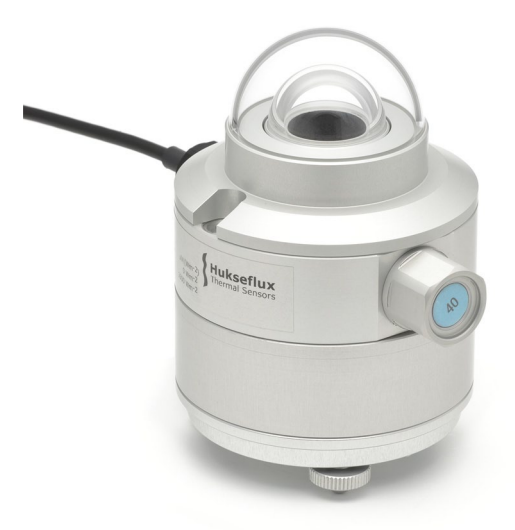
Figure 3 SR12-TR with its sun screen removed

SR12-TR pyranometer employs a thermal sensor with black coating, two glass domes and an anodised aluminium body, which also houses the transmitter.