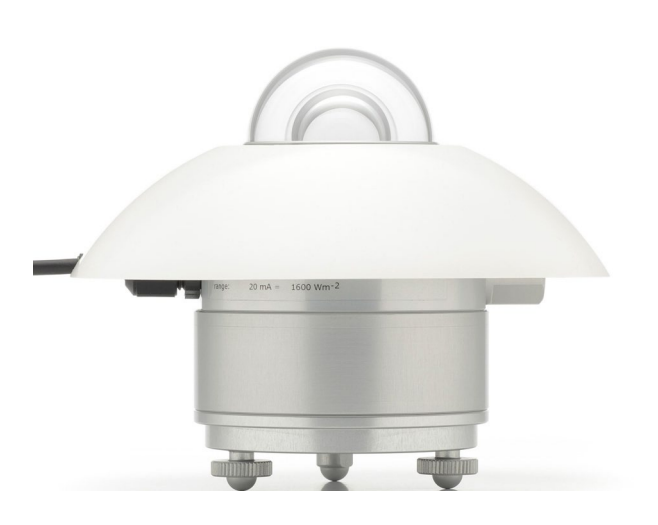
Figure 1 SR12-TR first class pyranometer for solar energy test applications with 4-20 mA transmitter

SR12-TR is a high accuracy solar radiation sensor that meets and exceeds the ISO 9060 standard performance mandate for a first class pyranometer for "solar energy test applications". It is the preferred instrument for PV system performance monitoring and is supplied with a temperature sensor and a heater. SR12-TR houses a 4-20 mA transmitter for easy read-out by dataloggers commonly used in the industry.