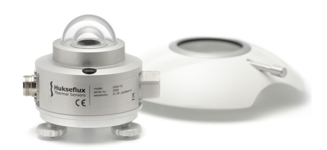
Figure 4 SR20 with its sun screen removed

The uncertainty of a measurement under outdoor conditions depends on many factors. Guidelines for uncertainty evaluation according to the "Guide to Expression of Uncertainty in Measurement" (GUM) can be found in our manuals. We provide spreadsheets to assist in the process of uncertainty evaluation of your measurement.