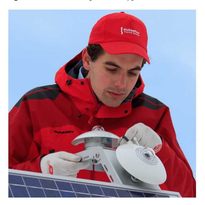
Figure 2 dual setup in PV system performance monitoring