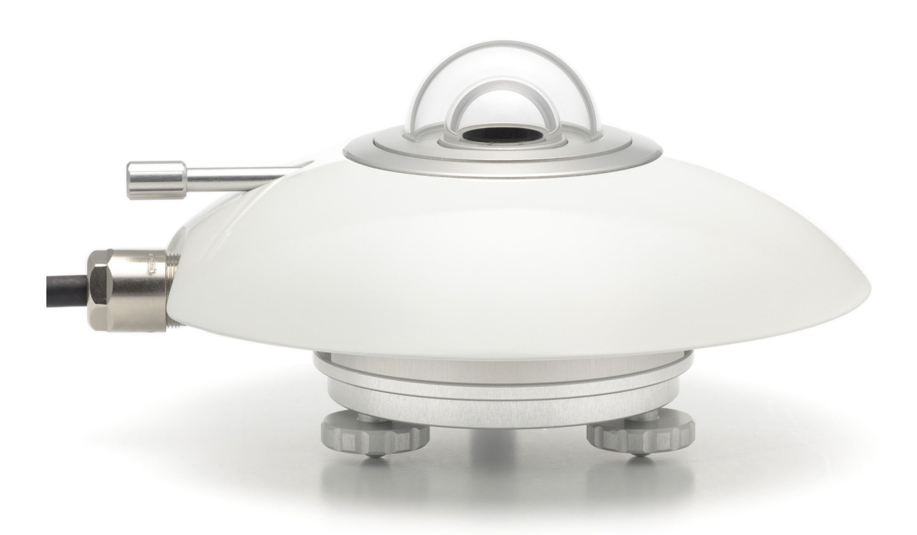
Figure 1 SR20 secondary standard pyranometer

SR20 is a solar radiation sensor of the highest category in the ISO 9060 classification system: secondary standard. SR20 pyranometer should be used where the highest measurement accuracy is required.