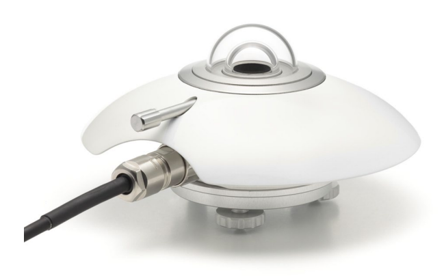
Figure 5 SR20 side view