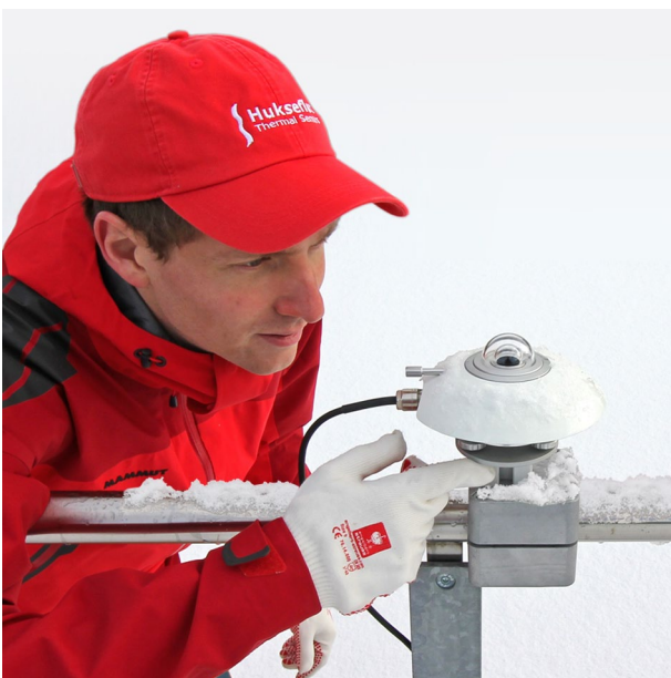
Figure 4 SR25 accelerating sublimation of snow, here shortly after snowfall

SR25 has a sapphire outer dome, glass inner dome and an internal heater. It employs a state-of-the-art thermopile sensor with black coated surface and an anodised aluminium body. The connector, desiccant holder and sun screen fixation are very robust and designed for long term use.