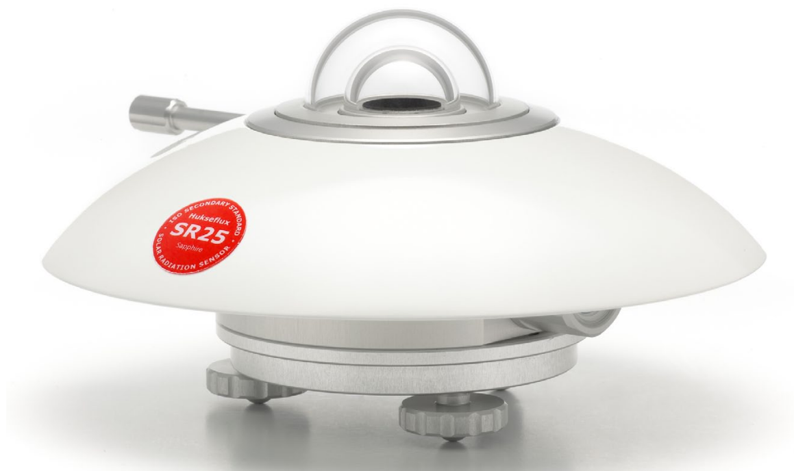
Figure 1 SR25 secondary standard pyranometer

SR25 takes solar radiation measurement to the next level. Using a sapphire outer dome, it has negligible zero offsets. SR25 is heated in order to suppress dew and frost deposition, maintaining its measurement accuracy. When heating SR25, the data availability and accuracy are higher than when ventilating traditional pyranometers. SR25 needs very low power. Patents on the SR25 working principle are pending.