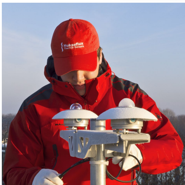
Figure 2 frost deposition: clear difference between SR25 (left), versus a non-heated pyranometer without sapphire dome (right)