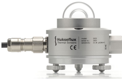
Figure 3 SR25 pyranometer with its sun screen removed

SR25 measures the solar radiation received by a plane surface, in \text{W/m}^2 , from a 180^\circ field of view angle. SR25 offers the best measurement accuracy: the specification limits of two major sources of measurement uncertainty have been greatly improved over competing pyranometers: “zero offset a” and temperature response.