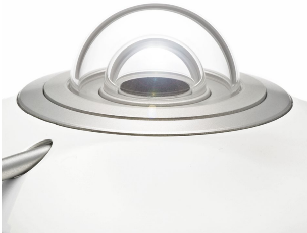
Figure 6 SR25's sapphire outer dome takes solar radiation measurement to the next level