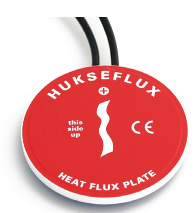
Figure 4 STP01 is often used in combination with HFP01SC self-calibrating heat flux sensor, shown in the picture

Figure 3 IT01 insertion tool is hammered down into the soil. After retracting it leaves a slit in which STP01 may be inserted