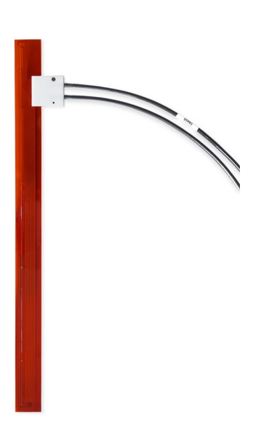
Figure 1 STP01 soil temperature profile sensor is applied in many large scale networks.

STP01 accurately measures the temperature profile of the soil at 5 depths close to its surface. It is used for scientific grade surface energy balance measurements. The sensor is buried and usually cannot be taken to the laboratory for calibration. The on-line self-test using the incorporated heating wire offers a solution to verify STP01's measurement stability.