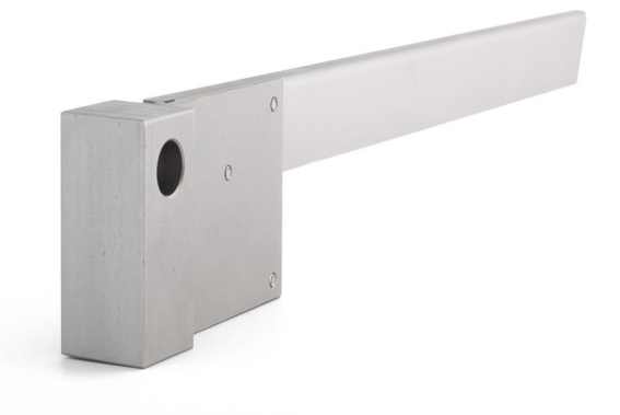
Figure 3 IT01 insertion tool is hammered down into the soil. After retracting it leaves a slit in which STP01 may be inserted

For ease of installation with a minimum of disturbance of the local soil, Hukseflux offers IT01 insertion tool.