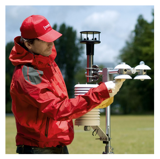
Figure 2 STP01 is often used in meteorological surface energy flux measurement stations